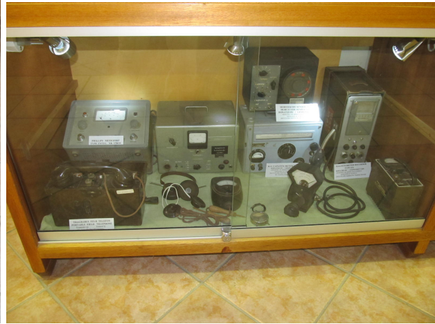
Field telephone, capacity meter & other