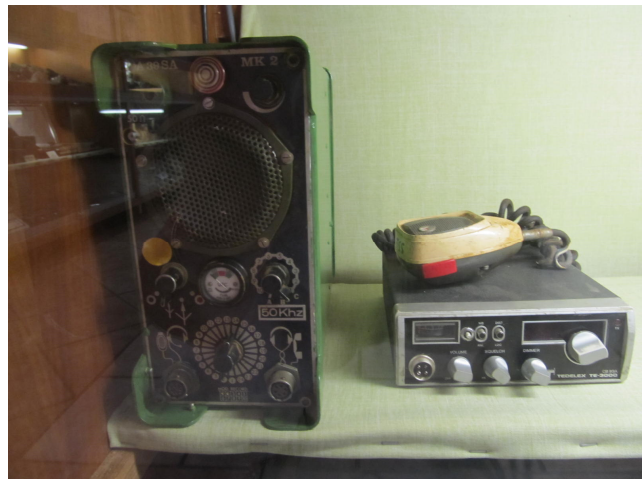
A398A and Tedelex Mobile Radios