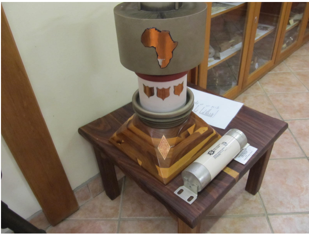
SARL Trophy from NARL