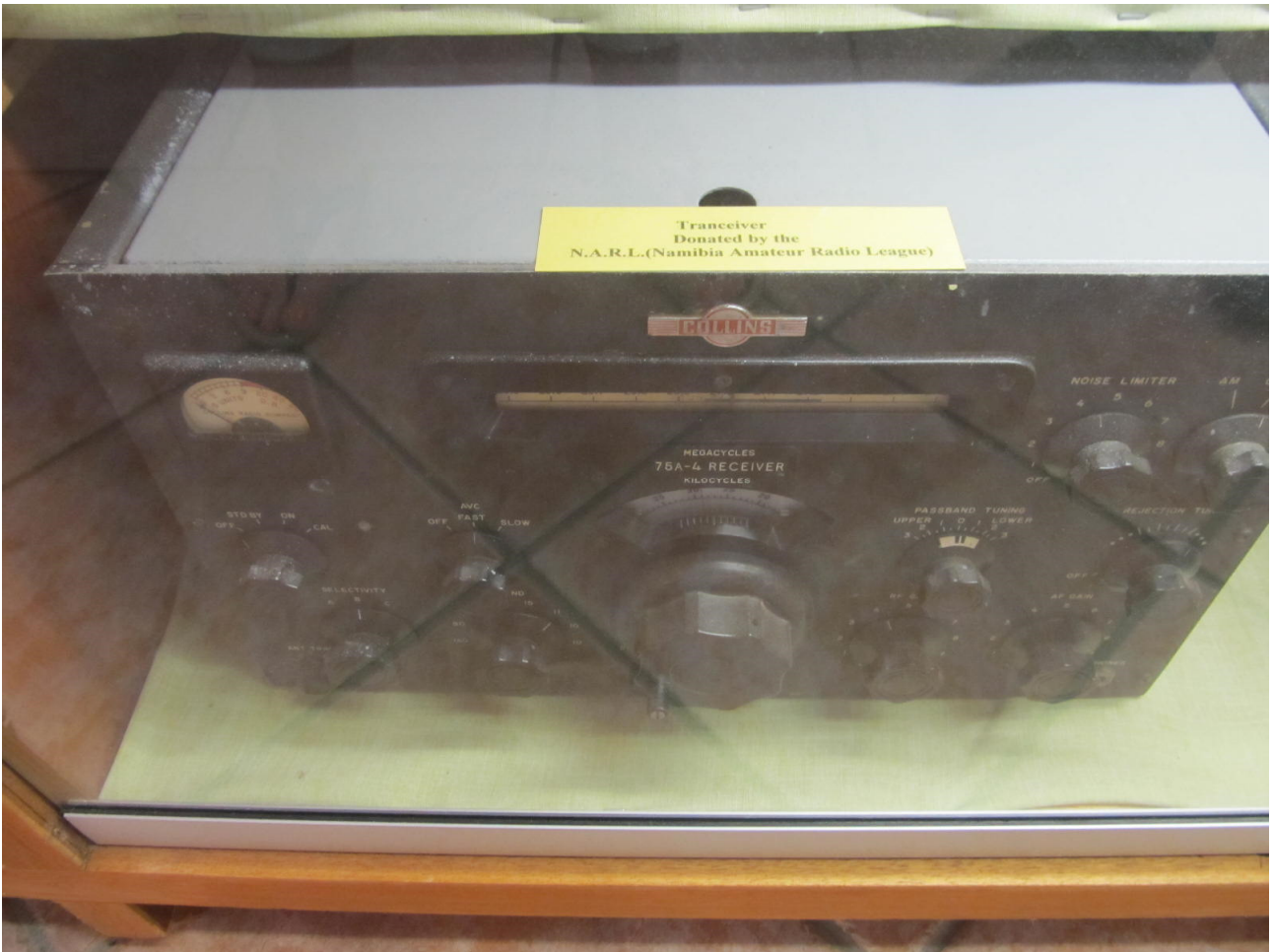
Radio receiver from NARL