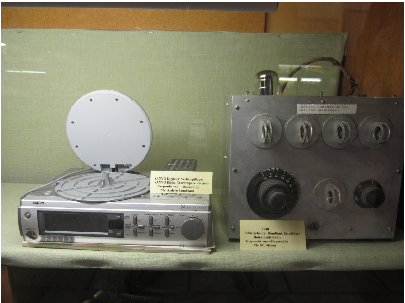
Sanyo Digital World Radio Receiver and home-made receiver