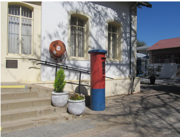
Tsumeb Museum entrance

Hopefully you will find this interesting.