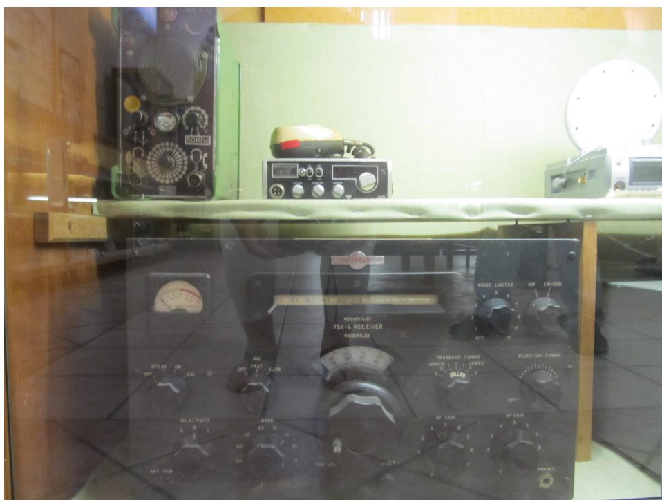
Radio equipment on display